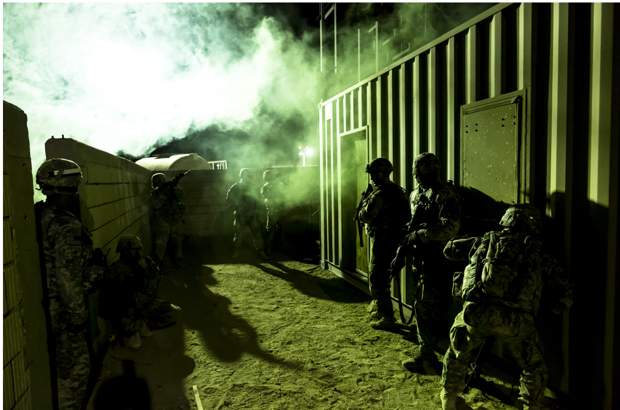
Soldiers from U.S. Army Central Command Warrior Leader Course conduct their final training lanes and evaluations with squads of soldiers versus mock opposing forces across multiple lanes during the early morning of July 11, 2014 in Camp Buehring, Kuwait.

Today, the Army is globally involved, preparing for a myriad of contingency operations, working ever-closer with an ever-growing list of international allies and partners. Therefore, providing the full picture of operations and exercises, no matter the scale, will make Soldiers feel more connected to their work, not just during said exercises, but in all regular tasks and duties. This can be accomplished by providing an